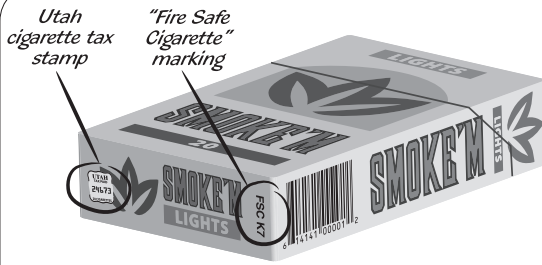
Figure 1: Markings on legal packs of cigarettes