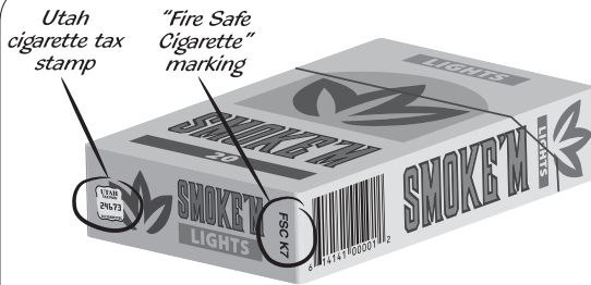
Figure 1: Markings on legal packs of cigarettes